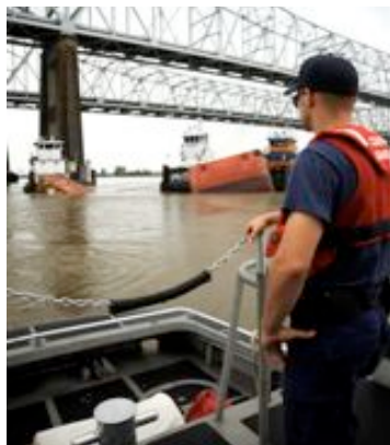
Broken & sinking barge on the Mississippi River after a collision.

In 2007, I introduced the Coast Guard’s Marine Safety Improvement Plan, which was followed shortly thereafter by the Marine Safety Performance Plan. Expanding the Coast Guard’s capacity and continuing to develop the expertise of our marine safety workforce is