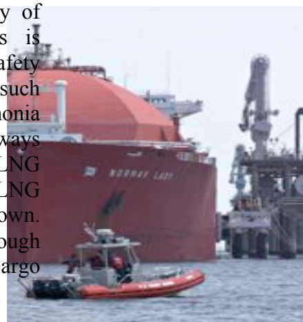
LNG Tanker security zone enforced by Coast Guard small boat.

As we pursue strategies, tactics and authorities to secure our borders from entry of dangerous materials and people, we must also consider the security of legitimate commerce in the maritime domain. This is particularly important when considering the health and safety risks vessels carrying Certain Dangerous Cargoes (CDCs) such as Liquefied Natural Gas (LNG), chlorine, anhydrous ammonia and various petroleum products present in our ports, waterways and adjacent population centers. The expansion of LNG facilities and corresponding increase in waterborne LNG shipments to meet our nation's energy demands is well known. However, LNG is just one of many CDCs transported through the MTS that must be considered in a national dialogue on cargo and energy infrastructure security.